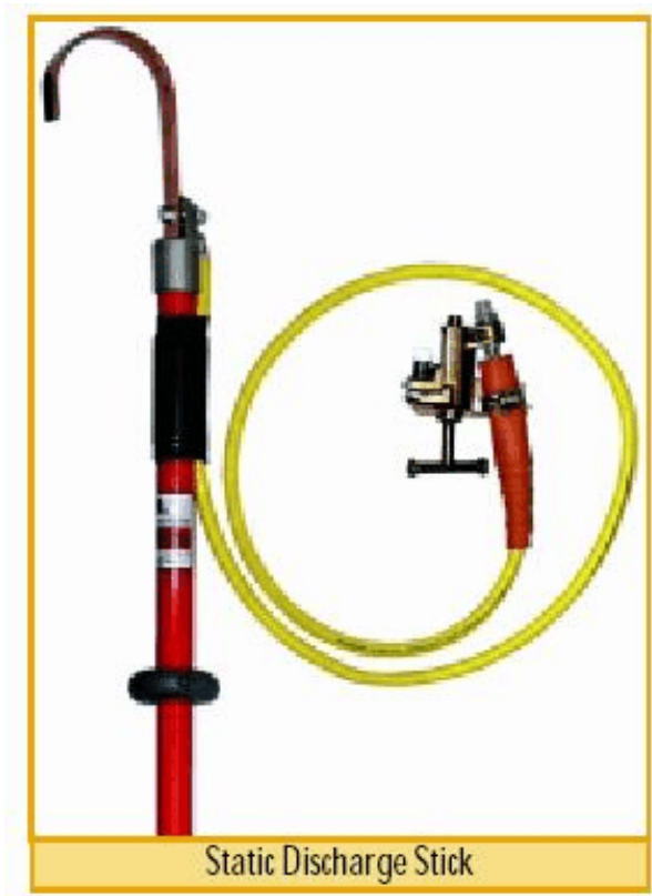
Our static discharge stick.

Static or Capacitive Discharge “Sticks” are available from North Star High Voltage at www.highvoltageprobes.com . These sticks are rugged devices for discharging anything which can store a charge. Protect your ears if you expect any discharge to occur.